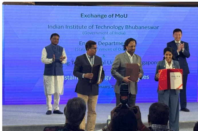
📌 Dignitaries present during the MoU signing ceremony in Bhubaneswar on Friday

BHUBANESWAR: The Energy Department of Odisha government has signed an MoU with Nanyang Technological University (NTU), Singapore, and IIT-Bhubaneswar for cutting-edge research and innovation in renewable energy technologies.